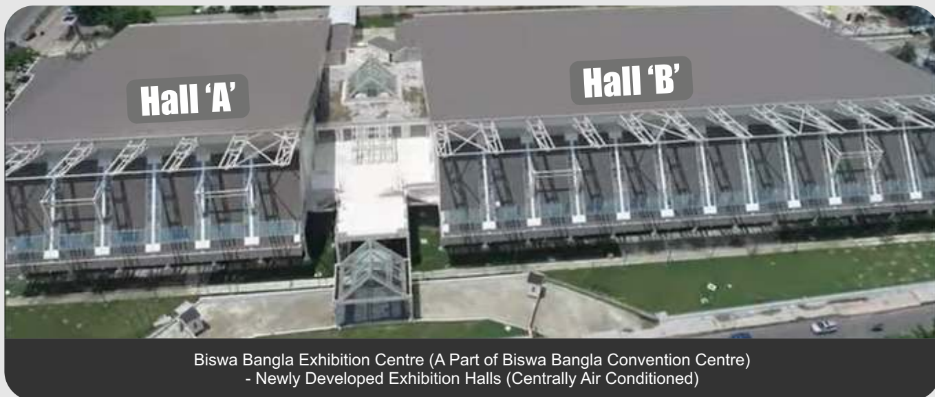
Biswa Bangla Exhibition Centre (A Part of Biswa Bangla Convention Centre) - Newly Developed Exhibition Halls (Centrally Air Conditioned)